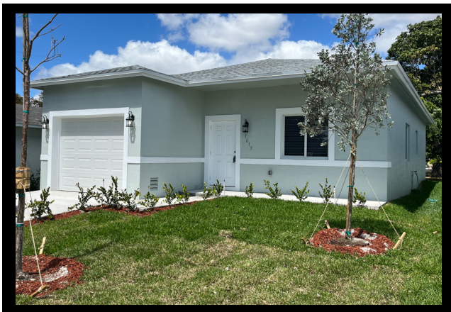
1615 NW 4 Street

The FLCDC continues to bring affordable housing to our community. We are proud to announce that we have recently completed two newly constructed homes this spring.