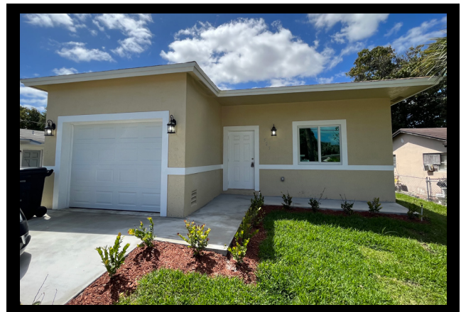
525 NW 17th Avenue