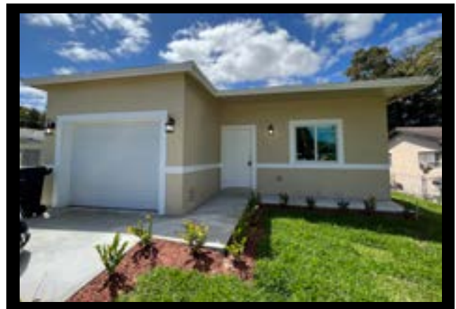
525 NW 17th Avenue