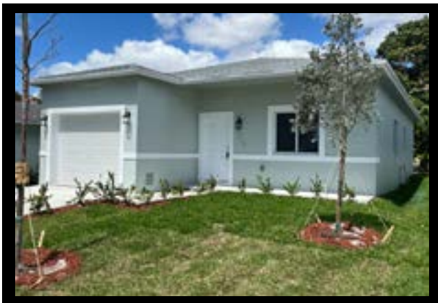
1615 NW 4 Street

The FLCDC continues to bring affordable housing to our community. We are proud to announce that we have recently completed two newly constructed homes this spring.